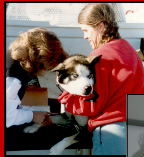
Susan Butcher, four time winner of the Alaskan Iditarod with her lead dog "Granite" during pre-race vet check exam.